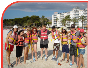
Collaboration and friendship across borders changes lives