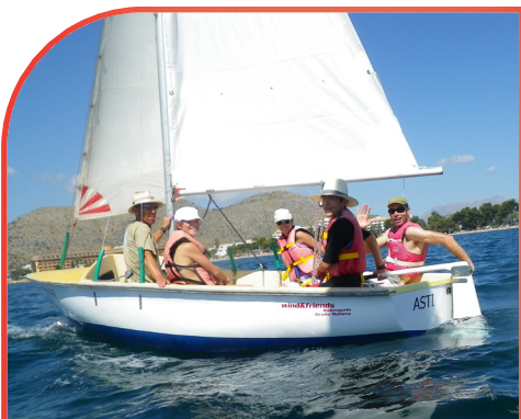
ECHDO youth camps welcome children from different countries

Within the network, members exchange resources to raise awareness and understanding of CHD and they collaborate on events including summer camps for young people.